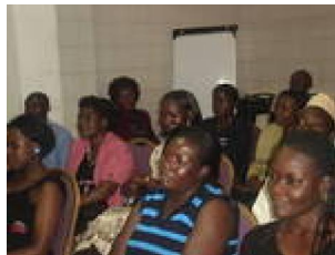
"The Information Professionals"