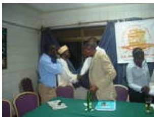
"Networking at the close"